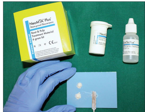
Figure 1: NeoMTA Plus manipulation

Conventionally, CH had been used for pulp therapy of immature permanent teeth. It was gradually taken over by MTA due to its comparable results and shortened treatment time. MTA can be used as a pulp capping agent, in the repair of perforations, apexification, and lately in RET. However both, its gray and white variants, possessed a discoloration potential which is unacceptable, especially in today's age of high-esthetic demand. Thus, there was a need for an alternative filling material which could provide both, a stain-proof restoration, as well as retain