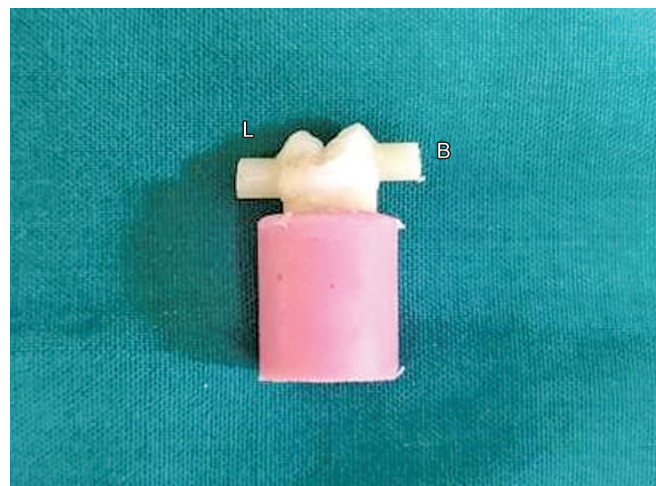
Fig. 1: Individual specimen—etched buccal surfaces (B) and nonetched lingual surface (L)

mold and stored in distilled water at room temperature for 1 week in order to avoid dehydration. 6–10 The specimens were mounted in dental acrylic with the treated surfaces parallel to the shearing rod of the universal testing machine (UNITEST-10, ACME Engineers, Pune) with a smooth, 0.4 mm diameter stainless steel rod attached to its upper member as shown in Figure 2. They were subjected to shear stress with a crosshead speed