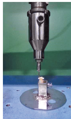
Fig. 2: Universal testing machine