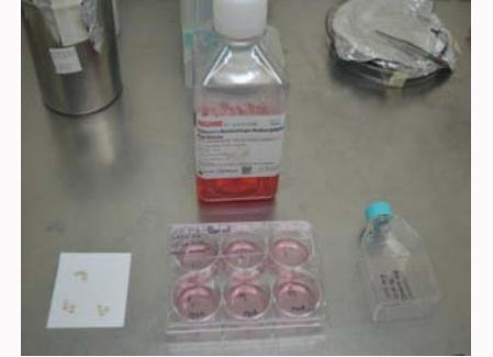
Figure 2: Murine t3t fibroblasts cultured with peek extract.