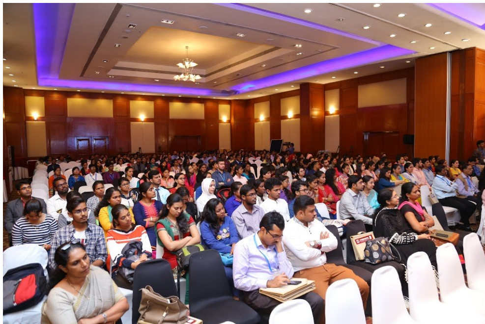
Figure 2: 15th national conference of the IAFO (2017) – delegates.

Apart from this, members of the IAFO have also been lecturing and serving as