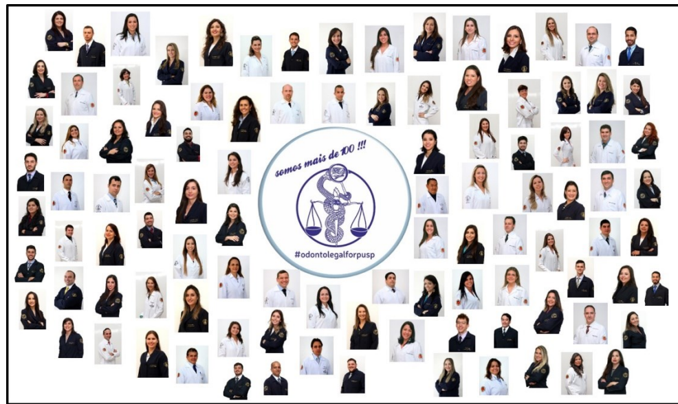
Figure 3: Tribute to the former students from the Forensic Odontology Specialization Program.