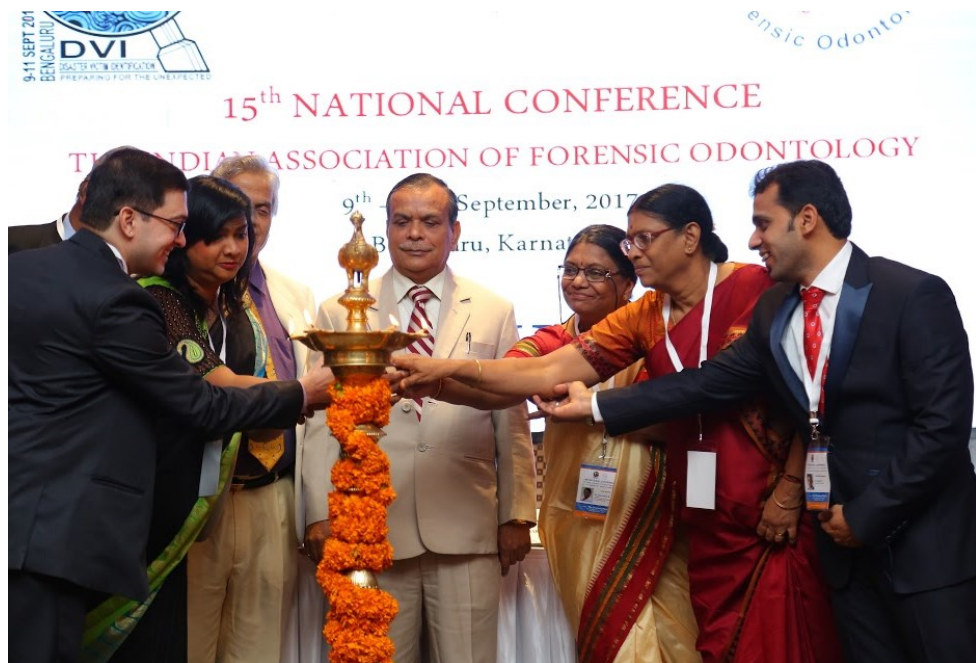
Figure 3: 15th national conference of the IAFO (2017) – Inauguration.