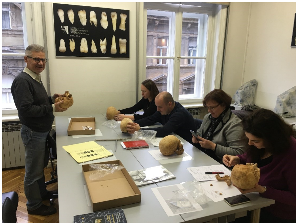
Figure 1: Prof. Kurt W. Alt and students at the course.

for living or dead people including skeletons of archaeological origin. Odontobiography is quite similar to dental profiling in forensic dentistry, but with a significant difference in the aim. The aim of dental profiling is to establish somebody's identity. The aim of making odontobiography is to reconstruct the life of an individual and to provide as many details as possible of