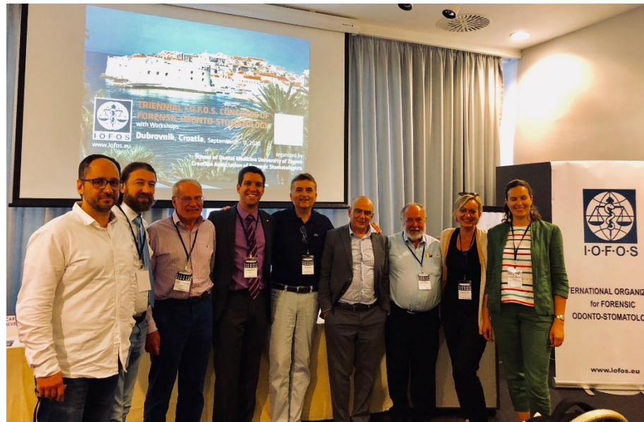
Figure 2: Some of the participants at the meeting.

On Friday, June 1st, a special session was held under the patronage of IOFOS. Forensic odontologists from Belgium, Brazil, Croatia, Denmark, Hungary, Ireland, Italy, FYR Macedonia and Serbia took part in this session.