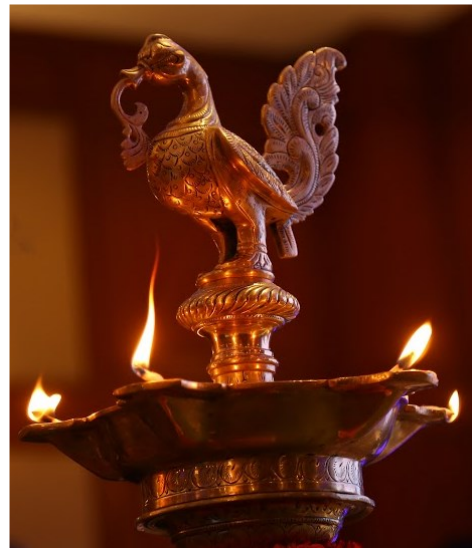
Figure 1: 15th national conference of the IAFO (2017) – ceremonial lamp.

have also been organised by various dental institutes under the patronage of the IAFO.