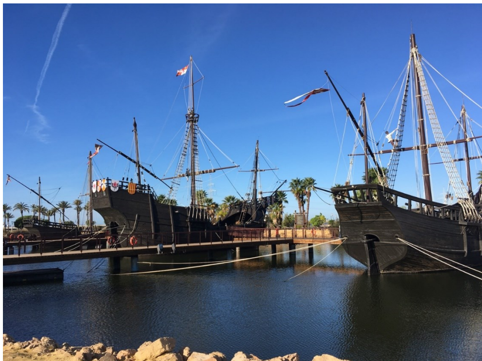
Figure 1: A traditional image of La Rábida (Huelva, Spain): El Muelle de las Carabelas (The Wharf of the Caravels), a museum whose most prominent exhibits are replicas of Christopher Columbus's boats, the Niña, the Pinta, and the Santa María, built in 1992 for the Celebration of the Fifth Centenary of the Discovery of America.

During October 18-21, 2017, the Sociedad de Odontostomatologos Forenses Iberoamericanos (SOFIA) held its IX Annual Meeting at the facilities of Santa María de La Rábida, Universidad Internacional de Andalucía (UNIA), in the city of Huelva (Spain). This meeting was held in collaboration with the Asociación Española de Antropología y Odontología Forense (AEAOF) and within the framework of a new anniversary of the discovery of America, under the motto "Forensic Anthropology and Forensic Odontology, Forensic Sciences in the Service of