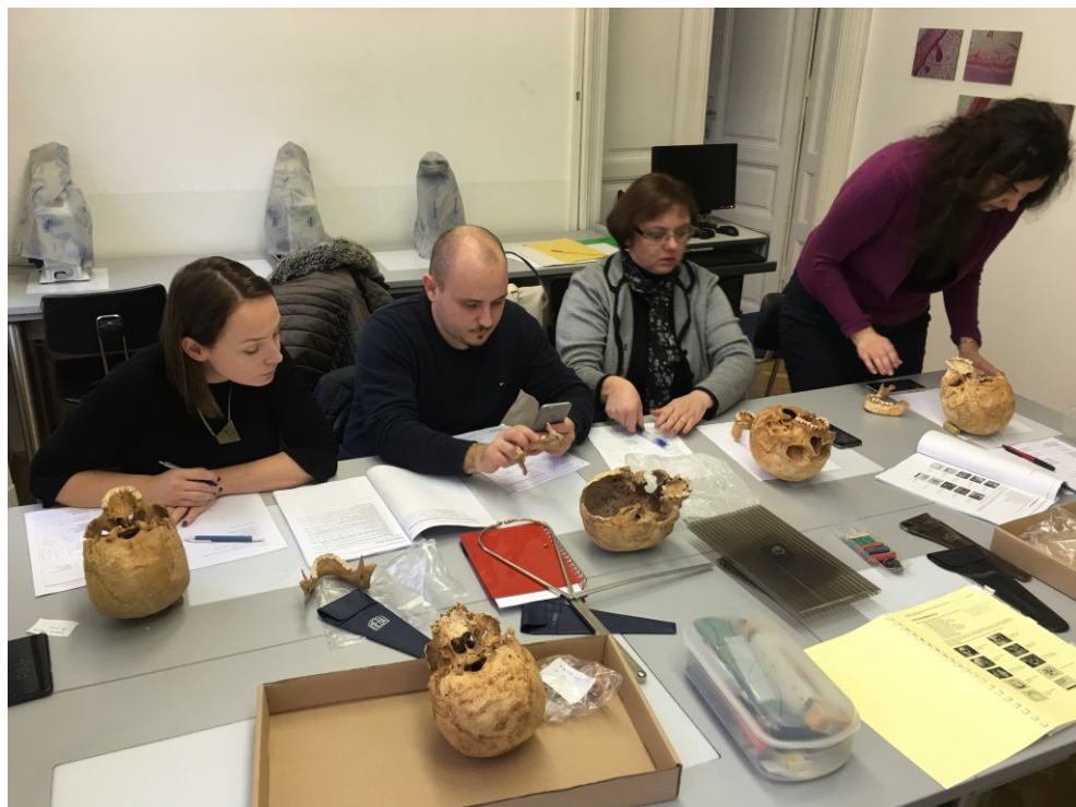
Figure 2: Practical work at the course.