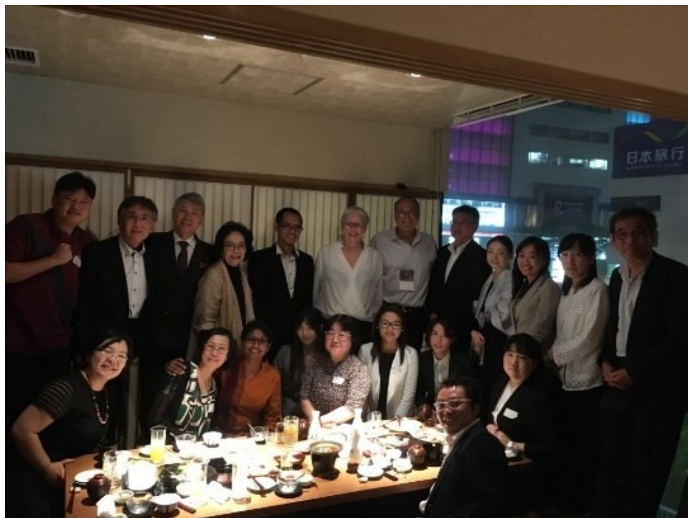
Figure 2: Forensic Dentists enjoying the social event.

talks to aspects of Human Rights and Quality Control. The message was clear, no one should be practicing forensic science in violation of the United Nations Declaration of Human Rights (1948 General Assembly resolution 217A) and carrying out any procedures which are not in accordance with Best International Practice and internationally recognised quality control parameters.