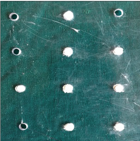
Figure 1: Polycarbonate blocks filled with OrthoMTA

The polymerized specimens were stored in 100% relative humidity at 37°C for 24 h. For shear bond strength testing, the specimens were secured in a holder placed on the platen of the testing machine and then sheared with a knife-edge blade on a universal testing machine (Lloyd LRX: Lloyd Instruments, Fareham, Hants, UK) at the junction of OrthoMTA and composite resin at a crosshead speed of 1.0 mm/min. Shear bond strength in MPa was calculated by dividing the peak load at failure with the specimen surface area.