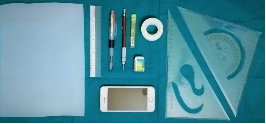
Fig-1: Research Armamentarium

In this study, 50 lateral cephalograms of patients were used. The distribution of male and female patient was randomly distributed. Digital cephalograms of the same lateral cephalograms were taken in a JPEG format. The list of research tools that were used are 0.3mm Pentel Graphgear 500 mechanical pencil, 0.3mm 2B Pilot pencil lead, a timer, a ruler, a protractor, erasers, 3M Scotch Tape, acetate sheets and Flair 0.5mm multicoloured pen. A smartphone that was used to install the CephNinja app was an iPhone SE with A9 chipset, 64 GB memory, 2 GB RAM, and iOS software of 11.1.2 (Figure-1).