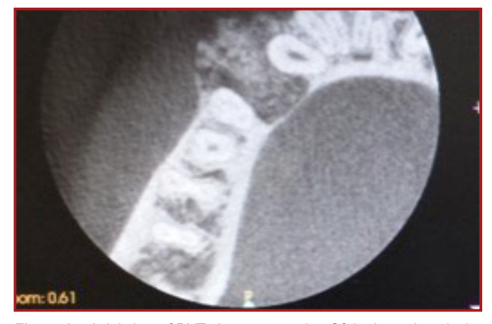
Figure 2a. Axial view of DVT shows expansion Of the buccal cortical plate and thinning of the Lingual cortical plate with flecks of radiopaque material within the internal structure.

nal structure in the axial view. A 3D Recon view also revealed mixed density due to a variable amount of radiopaque material between 43 and 44 with displacement of roots. Radiographic diagnosis of ossifying fibroma was established and the patient was subjected to excisional biopsy of the lesion (figure 2a).