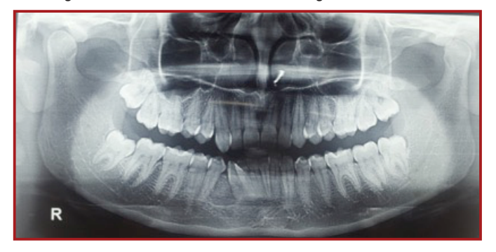
Figure 1b. Orthopantamography reveals a well defined unilocular mixed lesion with a well-corticated margin in the periapical region causing displacement of roots in relation to 43 and 44.

nal structure in the axial view. A 3D Recon view also revealed mixed density due to a variable amount of radiopaque material between 43 and 44 with displacement of roots. Radiographic diagnosis of ossifying fibroma was established and the patient was subjected to excisional biopsy of the lesion (figure 2a).